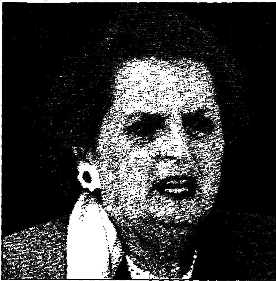
US Secretary of State Madeleine Albright: 'I am not among those who believe that if the world were run solely by women, war would disappear.'

"The Department of State and the Clinton administration have made some very strong